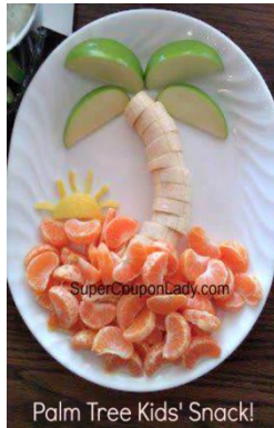
Palm Tree Kids' Snack!

Using apple slices, a banana, and pieces of mandarin oranges construct a Palm Tree!